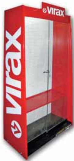
Empty displays stand