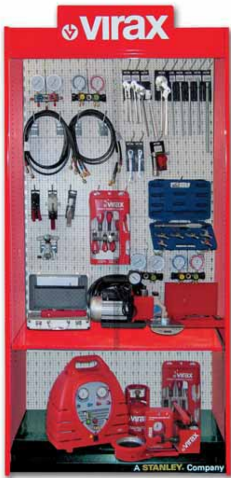
The picture is just for presentation purposes