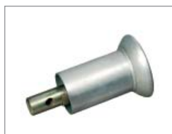
Mounting roll for tubeless tyres C4022287