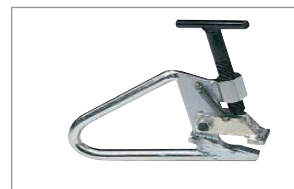
Clamp for steel rims