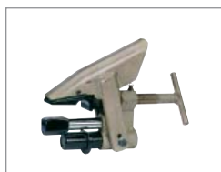
Clamp for alloy rims C4021852