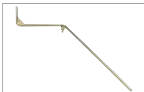
Bead pushing lever