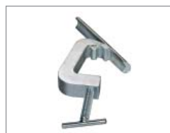
Skidder clamp C4003269