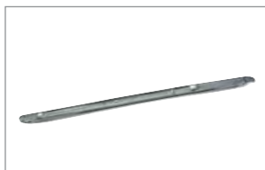
Short tyre lever