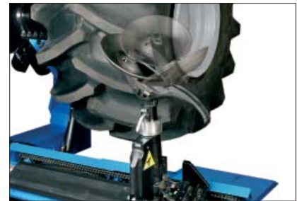
The mounting tool is adjustable by 180 deg. irrespective of arm position.

This power package can be used to change tyres on rims of 4" to 58" outside diameter.