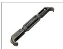
OTR extension for spit-ring rims C4007611