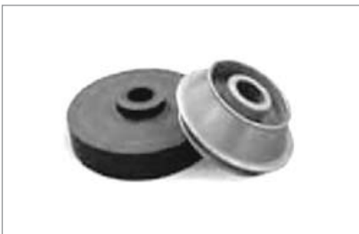
4026401 – Light-truck Kit with spacer, dia 112–168 mm