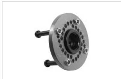
4029029 – Stud-hole flange FP VAG with circle dia. 5x100/112/120/130 mm